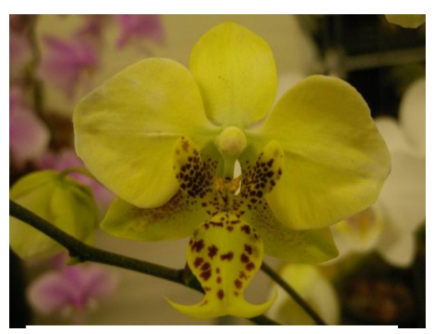
Phalaenopsis stuartiana (yellow form)