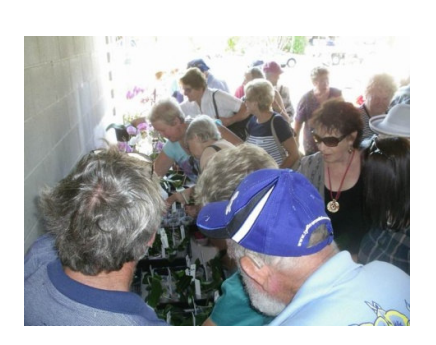
Grab a bargain – or two