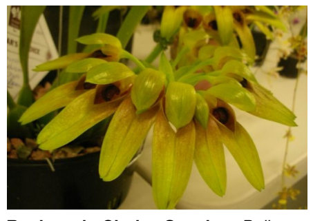
Registrar's Choice Species: Bulb. graveolens scored 79 Points –A Hughes