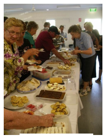
Eat more food