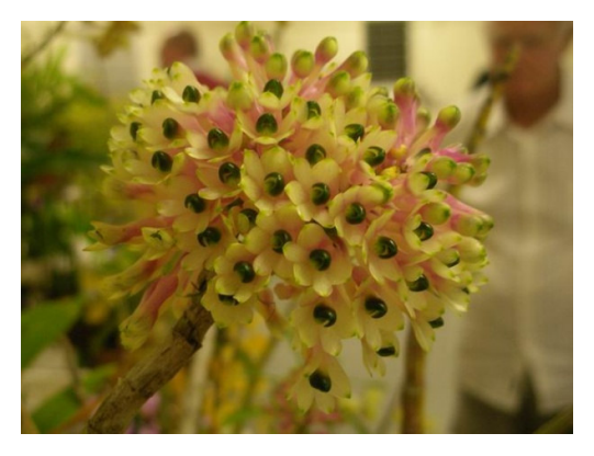
Dendrobium smilliae