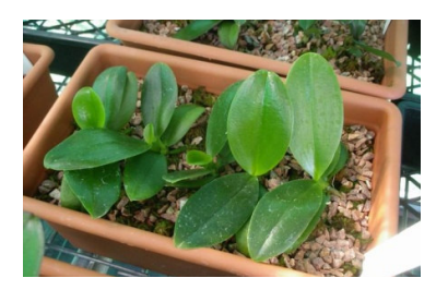
See new ideas for growing orchids

The Townsville Orchid Society held its annual field day on Sunday 2<sup>nd</sup> October, 2011. This pictorial record reminds us of just some of the things that go to making field days so popular. If you were unable to make it this time, oogle at the photographs and make notes in your diary to remind yourself to attend a few field days next year.