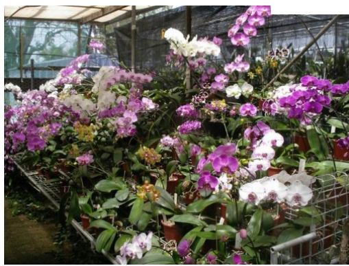
See how others grow their plants