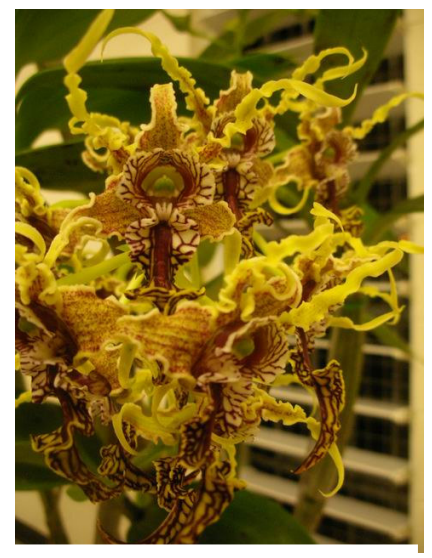
<u>Best Specimen:</u> Den. spectabile A Hughes