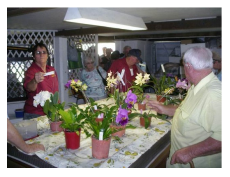
Decide on buying a few extra plants